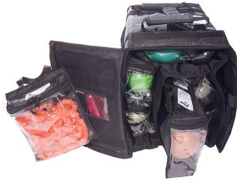
Stor-It end access when closed